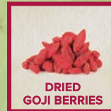
DRIED GOJI BERRIES